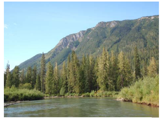
FIGURE 4. MITCHELL RIVER

Making fully informed judgments on our own may require the assistance of outside persons and organizations with the requisite expertise, with the ability to communicate their analyses intelligibly, and in whom the NStQ can place their trust. Unless otherwise agreed, those who come to the NStQ to consult about their proposals must ensure the NStQ